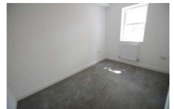
APT 1, 1A VERNON TERRACE, LOWER BRISTOL ROAD, BATH TOTAL APPROX. FLOOR AREA 406 SQ.FT. (37.7 SQ.M.)

Whilst every attempt has been made to ensure the accuracy of the floor plan contained here, measurements of doors, windows, rooms and any other items are approximate and no responsibility is taken for any error, omission, or mis-statement. This plan is for illustrative purposes only and should be used as such by any prospective purchaser. The services, systems and appliances shown have not been tested and no guarantee